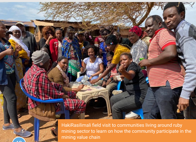
HakiRasilimali field visit to communities living around ruby mining sector to learn on how the community participate in the mining value chain

The annual budgeting process for villages/wards/districts requires participation from community members at each level. Villagers, with support from district and ward facilitators, suggest and prioritise community development projects. This at least provides a precedent for budgeting and project input from local community members, including women. However, the Local Government District Authorities Act fails to require women's membership on Village Councils, District Councils, or Township Authorities.