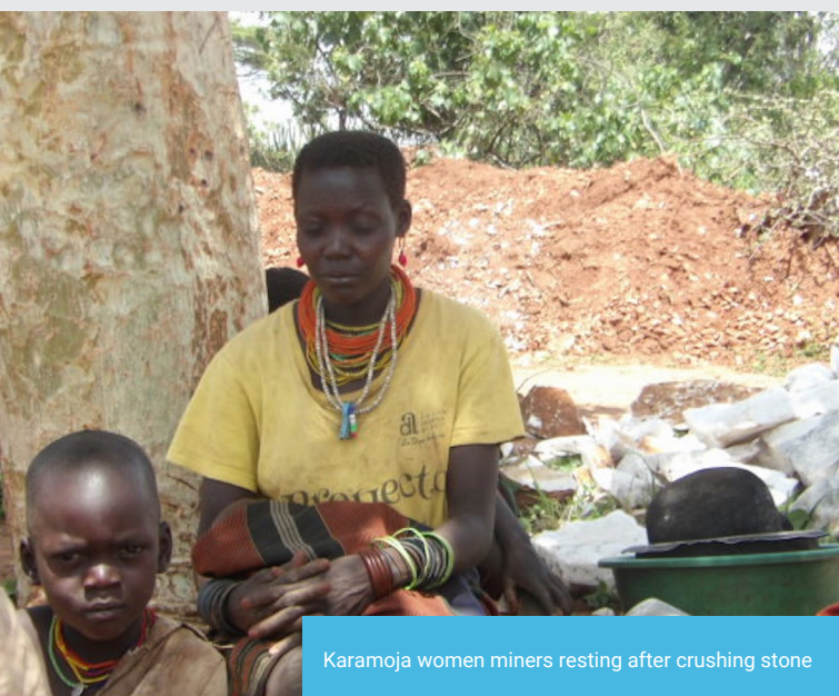
Karamoja women miners resting after crushing stone