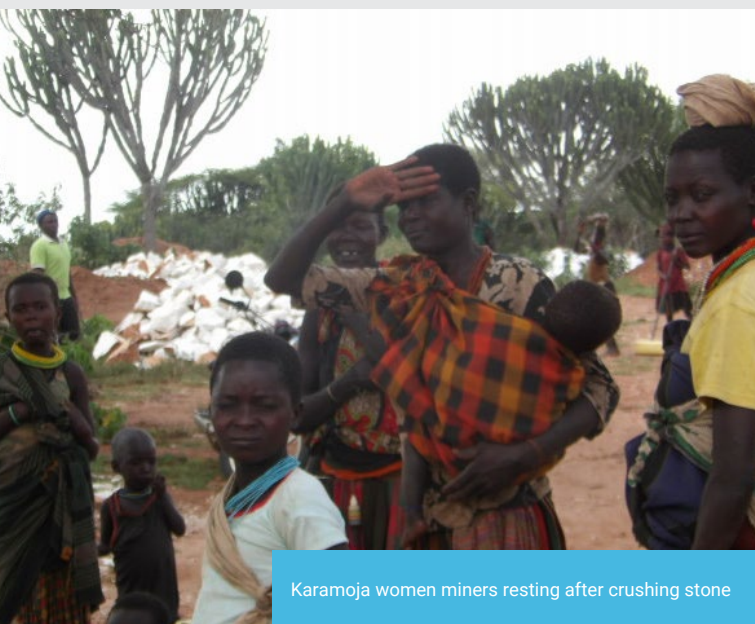
Karamoja women miners resting after crushing stone

scoping study on raising public awareness of gender issues will not ensure that they are mainstreamed into extractives governance, which would require government and extractive industry company awareness and related specifically-designed activities. Toward this end, discrete gender components should be included within the many scoping studies listed in the work plan.