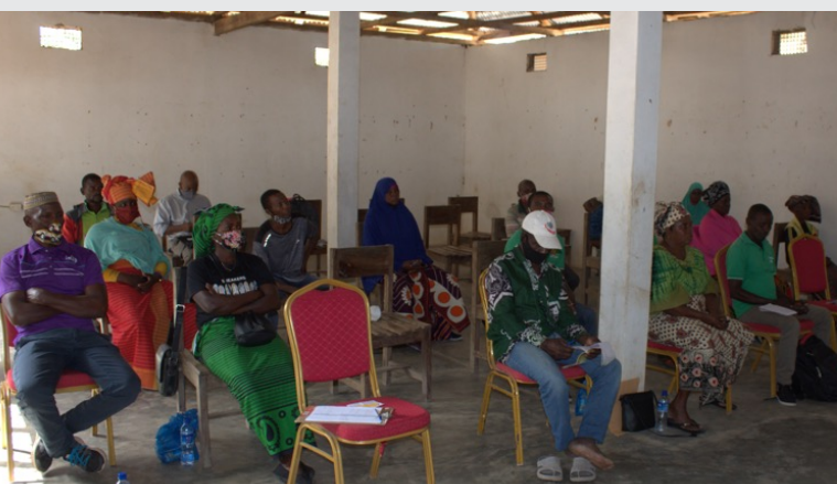
Partial View of the participantes during the validation of the study results with communities in the district of Larde, Nampula province.

Finally, while Mozambique's Constitution provides that women and men are equal before the law (art. 36), and that the state "promotes, supports and values the development of women and encourages their growing role in society, in all spheres of the country's political, economic, social and cultural activity" (art. 122), the state also recognises "legal pluralism" and customary systems and rules, to the extent that they are not contrary to the fundamental principles and values of the Constitution (art. 4) (RoM, 2004, 2018). Overall, most laws are "neither applicable nor favourable to women," and also "sexual discrimination, gender violence, traditions and perceptions, ignorance of the laws, and the culture...perpetuates the inferiorization of women" (KUWUKAJDA, 2021).