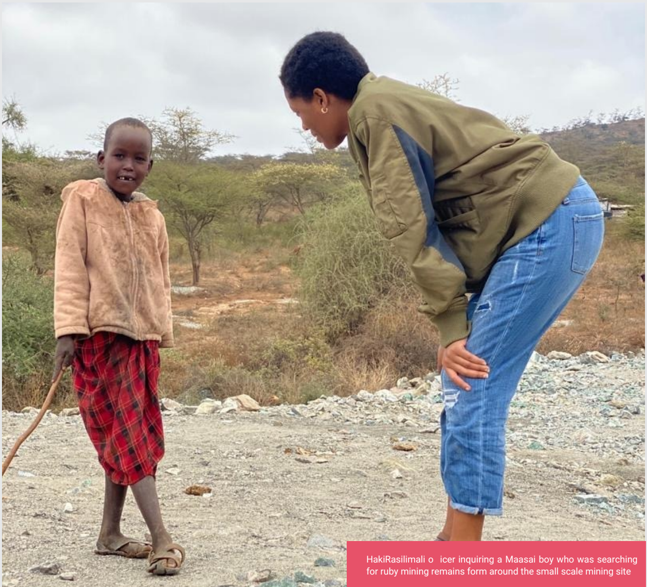
HakiRasilimali officer inquiring a Maasai boy who was searching for ruby mining remains form around the small scale mining site