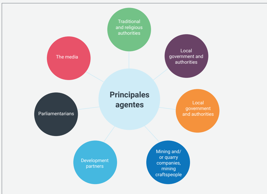
Diagram 4: main stakeholders during advocacy campaigns

This phase mainly focussed on parliamentarians and the executive.