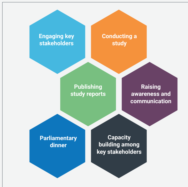
Diagram 3: modelling of complementary actions carried out during different campaigns

on individual cases (specific area of study, objectives, etc.), the campaigns also involved and/or addressed the issue of gender and ethnic minorities. This was notably the case when training women and Pygmy people on how to monitor mining projects in the north (Figuil limestone and marble mining) and south (Mbalam iron mining) of the country respectively.