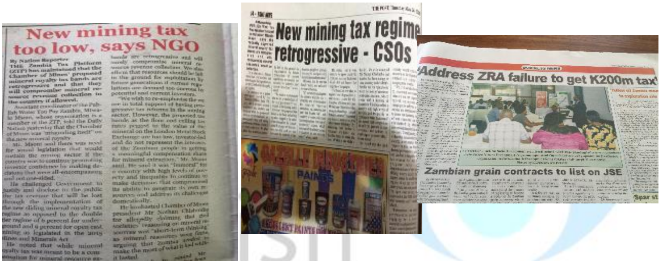
Some media coverage linking the African Mining Vision to specific extractive taxation issues

The a draft framework has since been developed following inputs from various stakeholders and the PWYP assistant coordinator was hence nominated to be part of the technical team to scrutinize the drafted framework, and develop a structure in which the draft framework would be implemented in Accra Ghana from the 11-14 th of April 2016.